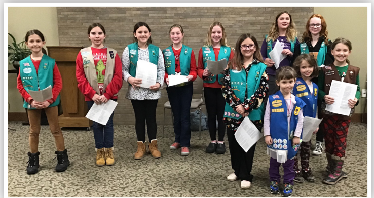
The Girl Scouts caroling for the residents. ▶