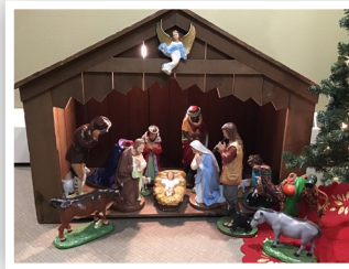
▲ The nativity scene donated by St. Joseph Church.

Thank you to St. Joseph Catholic Church volunteers for making St. Luke's festive for Christmas.