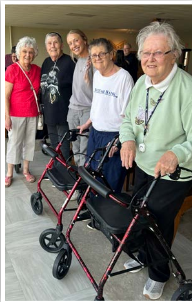
PAV tenants had a beautiful day visiting the Assumption Abbey. ►