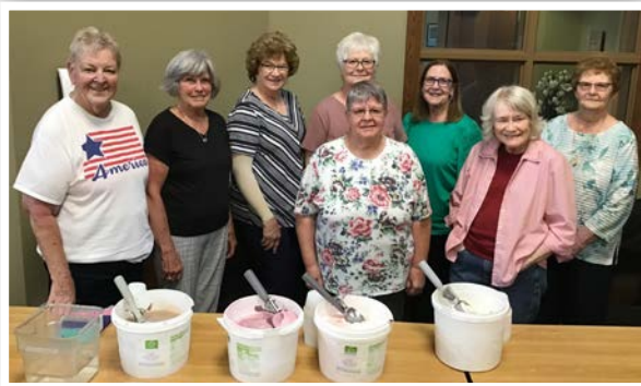
▲ Thank you, Our Redeemer's Lutheran, New England for serving the home-made ice cream to the residents.

Making ice cream is one of the residents' favorite activities, after Bingo of course. Going hand in hand with making the ice cream is sampling it while listening to Old-Time or Classic Country music, and even a little Rock N' Roll.