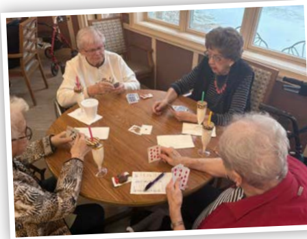
▲ An afternoon well spent with cards, treats, and great company!