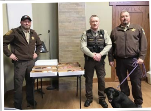
▲ A heartfelt thank you to the Stark County Sheriff's Office for the yummy donuts and a wonderful visit!

St. Luke's residents had a great time, sharing coffee and donuts with the Stark County Sheriff's Department in honor of National Law Enforcement Appreciation Day. Thank you to the Stark County Sheriff's Office for visiting and having coffee with St. Luke's Home residents.