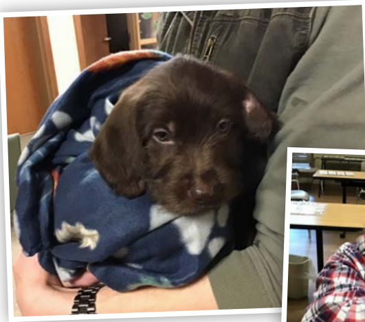
▲ Meet our new furry friend at St. Luke's, Henry.