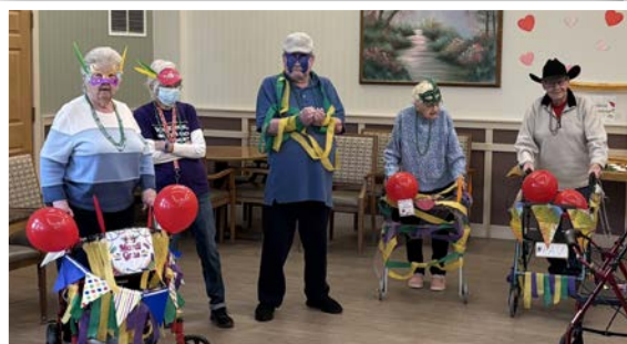
▲ The start of the tenant parade.